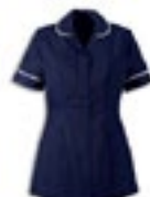
Sister / Charge Nurse