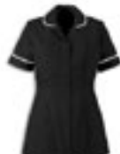
Advanced / Emergency Nurse Practitioner