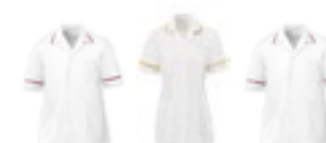
Student Nurse / Trainee Nursing Associate (Middlesex / London South Bank)