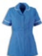
Junior Sister / Junior Charge Nurse