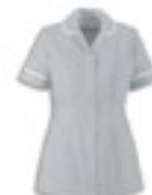
Health Care Assistant