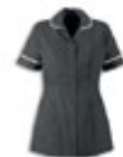
Practice Development Nurse / Education (Senior Nurse )